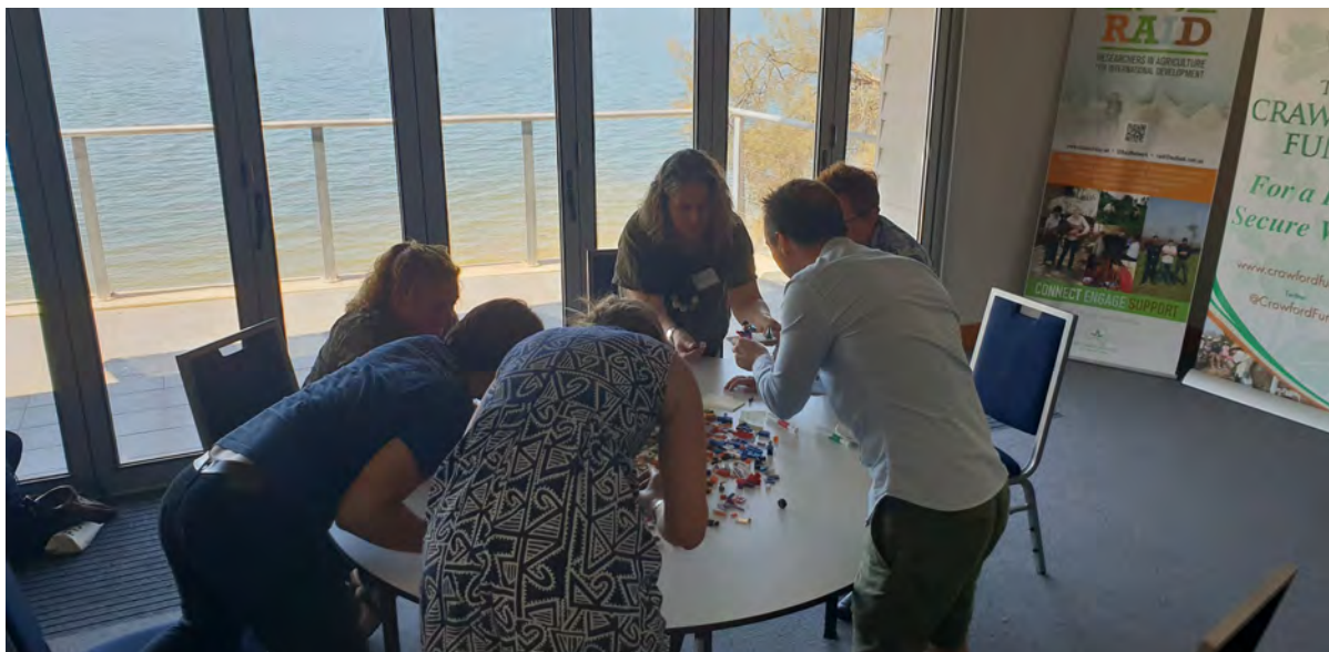
Participants at the Perth Workshop (March 2020).