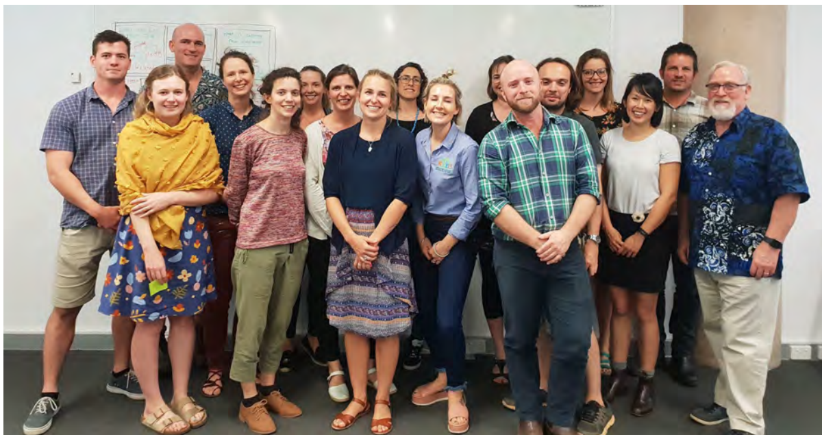
Figure 2. Participants at the Darwin workshop (September 2019).